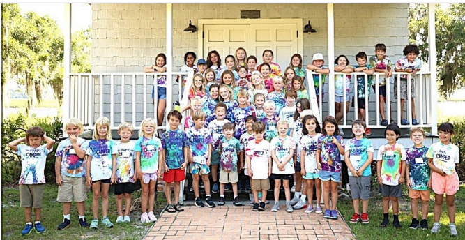
Summer Fun Daze 2025 at Wesley Gardens Retreat!