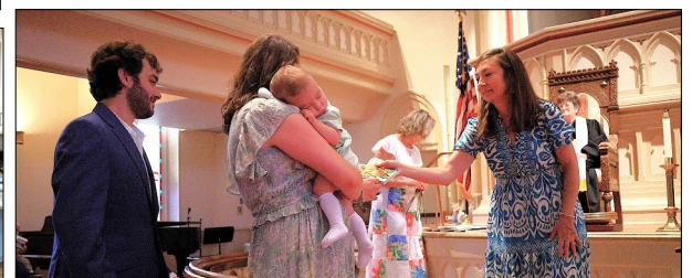
Infant Recognition Sunday