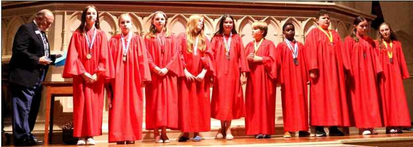
Fifth graders receiving music awards.