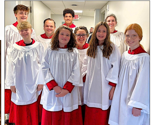
Youth Choir led worship on May 4.