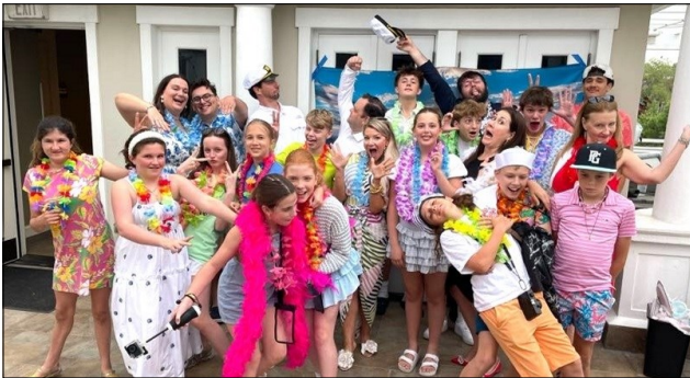
Youth Murder Mystery Night!