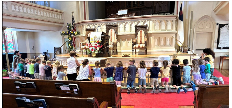
Eli's Place children participating in the National Day of Prayer.