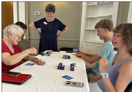
Members enjoying a little Meet and Mingle time on Sunday afternoons prior to the evening worship service in the Wesley Gardens Chapel.