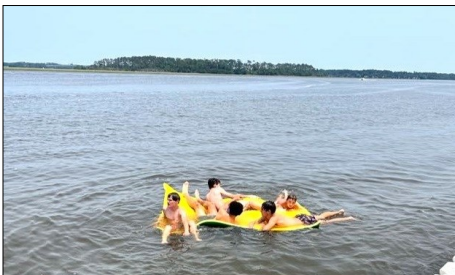
Youth having fun in the sun on Sundays at Wesley Gardens Retreat!