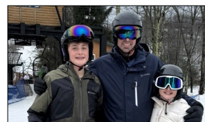
Youth attending their annual Winter Retreat at Winter Place, WV.