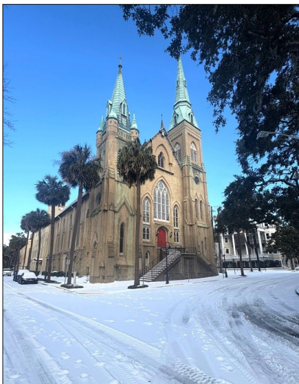
Wesley Monumental surrounded by snow on January 22, 2025.