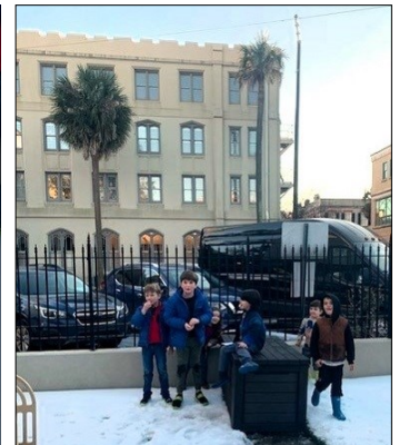
Wesley children enjoying playing in the snow while parents attend the Meaningful Marriage Retreat.