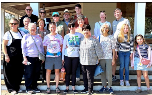
February Meet & Mingle at Hope Ranch Zoo.