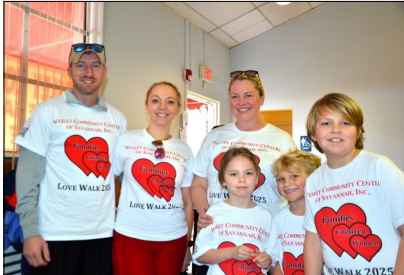
Twelve adults and five children or youth walked or ran 3.6 miles through the Historic District at the Wesley Community Center Love Walk, held on February 8.