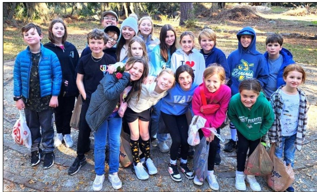
Fourth and Fifth graders attending their New Year's Retreat at Wesley Gardens.