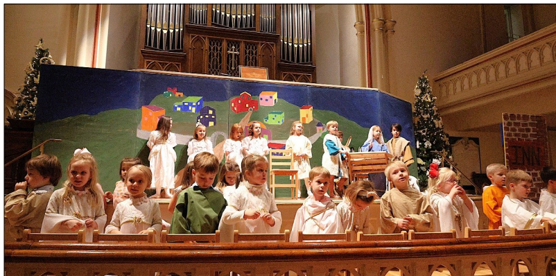
Joyful Noise Choir Christmas Celebration