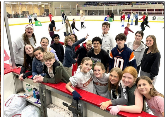
Wesley Youth ice skating at the Civic Center.