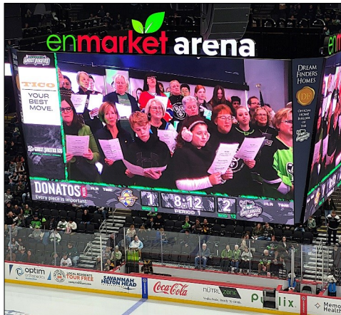
Wesley Choirs singing at the January Ghost Pirates game.