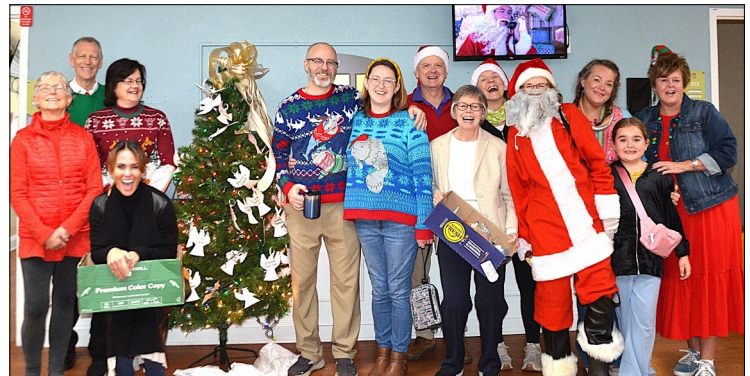
Wesley members visiting hospitals and nursing homes on Christmas morning.