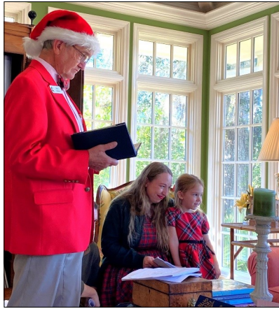
Three days before Christmas, over 50 chancel choir, youth choir, and friends caroled and gave communion to homebound church members.