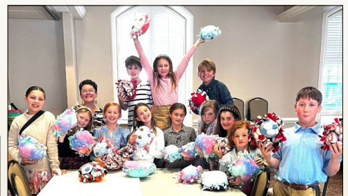
Sunday fun with our 4th & 5th graders!