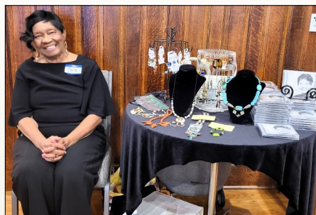
Wesley's Christmas Bazaar was held November 2 in Oliver Hall.