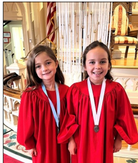
Friends singing Holy, Holy, Holy in church.