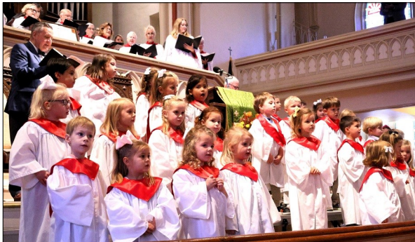
Joyful Noise Choir leading worship.