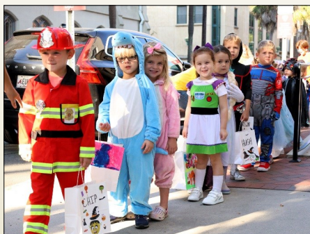
Our Eli's Place friends walking in their annual Storybook Character parade.