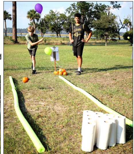
Youth helping and having fun at the Fall Festival at Wesley Gardens Retreat.