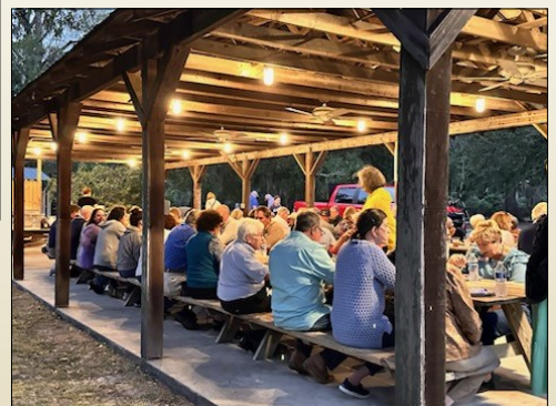
Meet and Mingle low country boil.