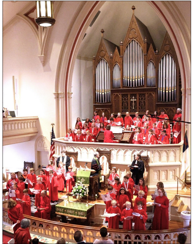
First through fifth graders leading worship.