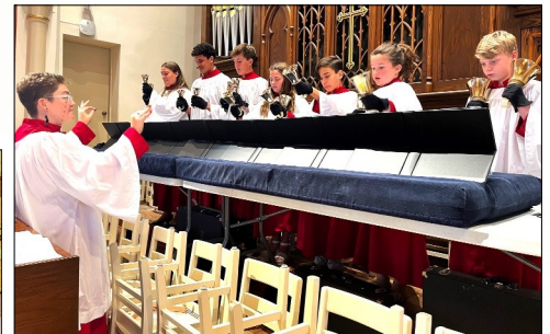
Youth & Adult Handbell Choirs in worship.