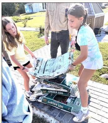
Youth fall break was filled with lots of fun and service