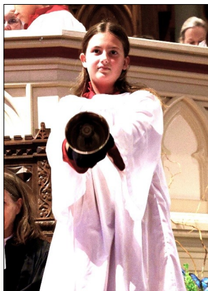
Chiming of the Hour