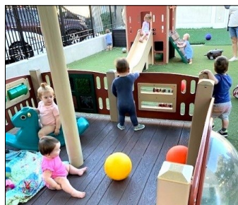
Eli's Place Toddler class on the playground.

Making apple pies to celebrate Johnny Appleseed's 250th birthday!