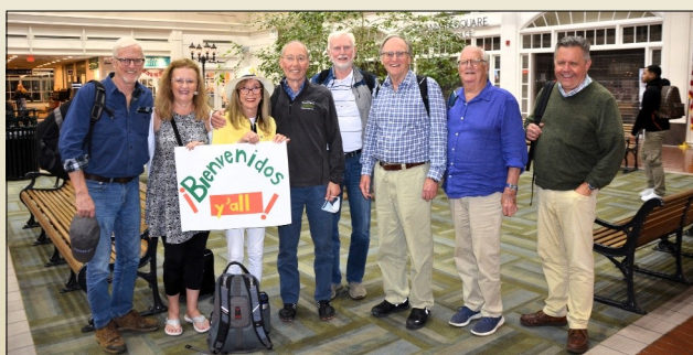
14 participants went on a mission trip to Santa Elena, Honduras, from Feb. 11-18, and they built three houses and led a Bible school for children.