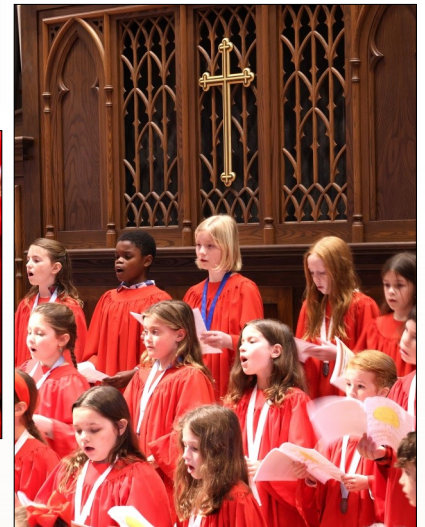
Children's Choir and Joyful Noise Choir lead worship on February 11.