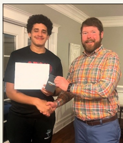
Youth Super Bowl Party!