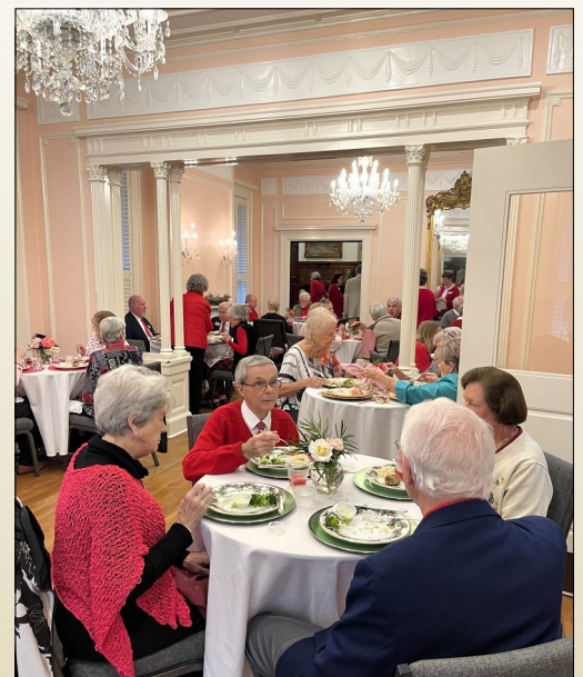
The Merry Makers enjoy a fun Valentine's luncheon held in the Parlor of Oliver Hall.