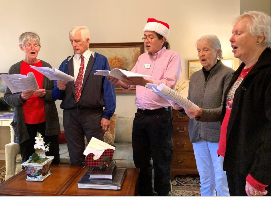
Wesley Chancel Choir carols to church _____ members receiving communion.