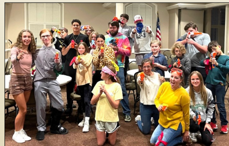
Youth playing Humans vs. Zombies.