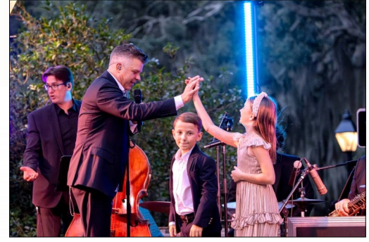
Cabaret Under the Stars