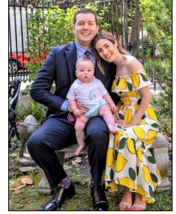
On Infant Recognition Sunday, we honored more than 20 families who welcomed babies into this world this past year.