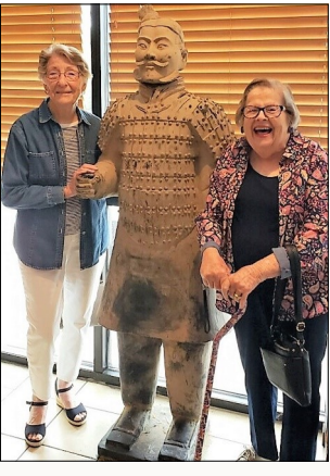
Dutch treat at Asian River with the Merry Makers.