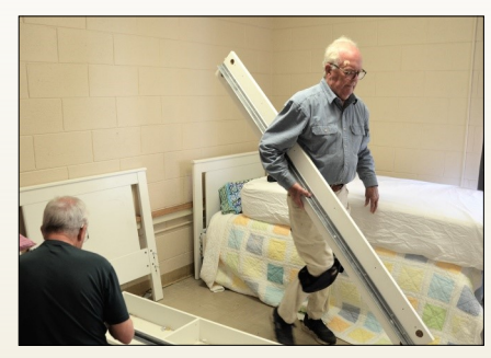
Family Promise bed disassembly.