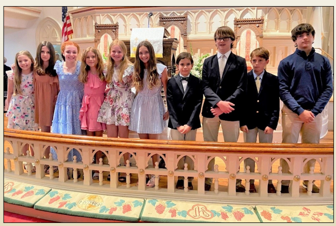
On April 30 and May 7, the Confirmands took vows of membership and became full members of the body of Christ gathered here at Wesley Monumental.