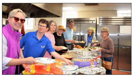
Wesley members serving dinner to Urban Hope families.