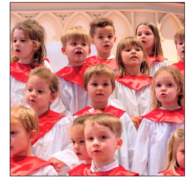
Joyful Noise Choir singing in the Children's Easter Program.