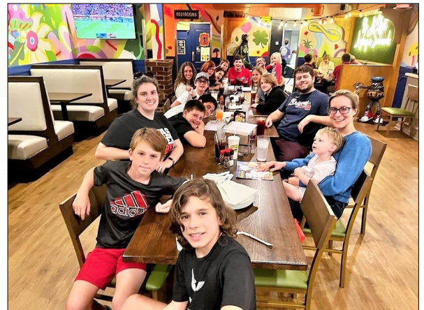
Youth Choir at Mellow Mushroom