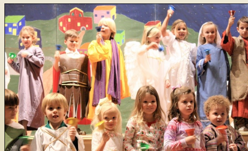
Joyful Noise Christmas Celebration