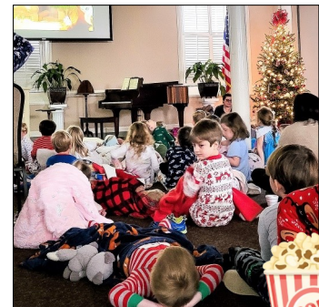
Pajamas and Popcorn Day