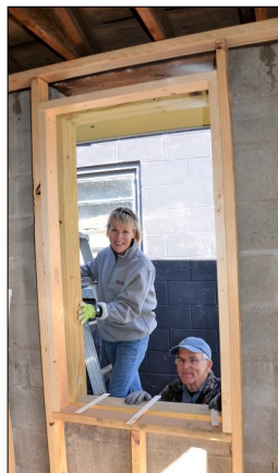
Construction Ministry installation of windows for Family Promise homes located on Cumming Street