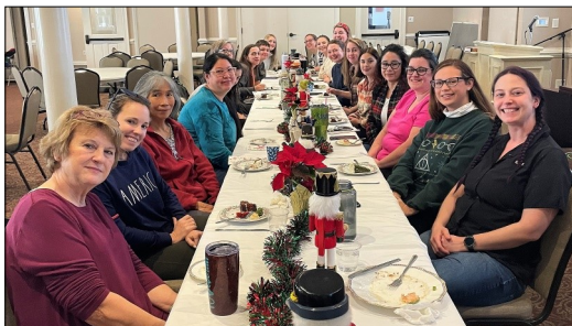
Teachers and staff enjoying their annual Christmas luncheon