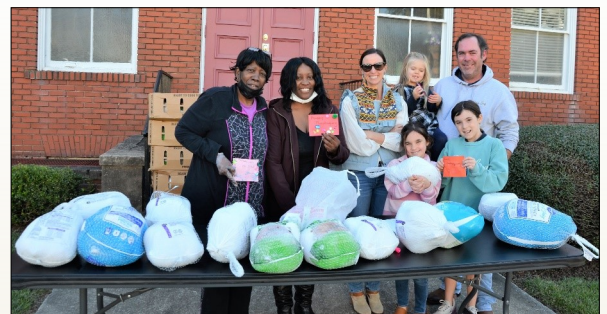
Thanksgiving turkeys for Urban Hope families