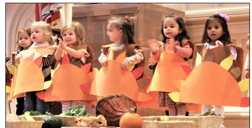
Thanksgiving Program and Pie Party