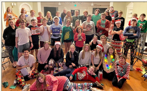
Youth Christmas Party