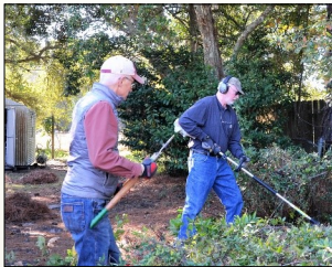
Thank you to all members who did major yard work for an elderly widow.