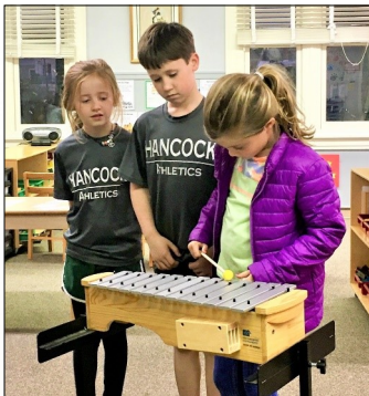
Wednesday evening music class.