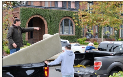
Y'All Haul led by church members delivered furniture for a Family Promise formerly homeless pair of families.