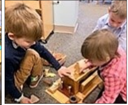
Sunday morning fun!