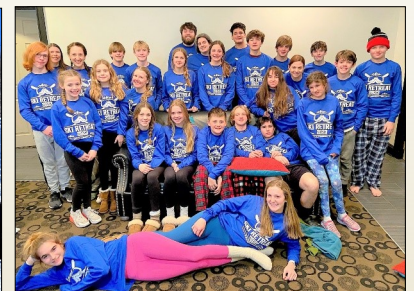
Over the weekend of February 2-5, the youth group enjoyed a ski retreat in West Virginia.