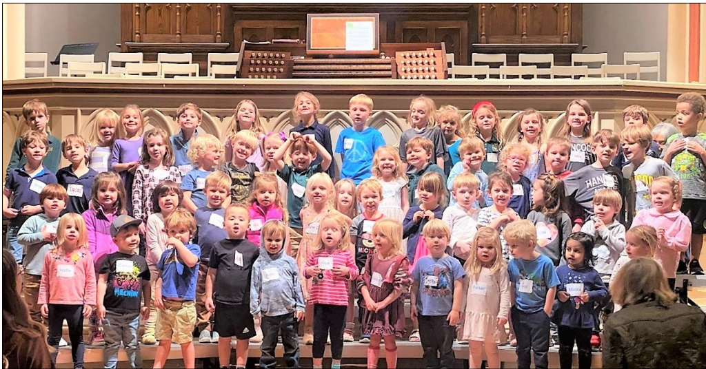
Joyful Noise choir rehearsing for the Children of the Light concert on February 26!