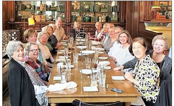
Following their tour of SCAD, the Merry Makers enjoyed a delicious lunch at the Gryphon.