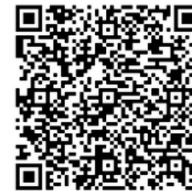
WNS & Small Group Studies for Adults Registration