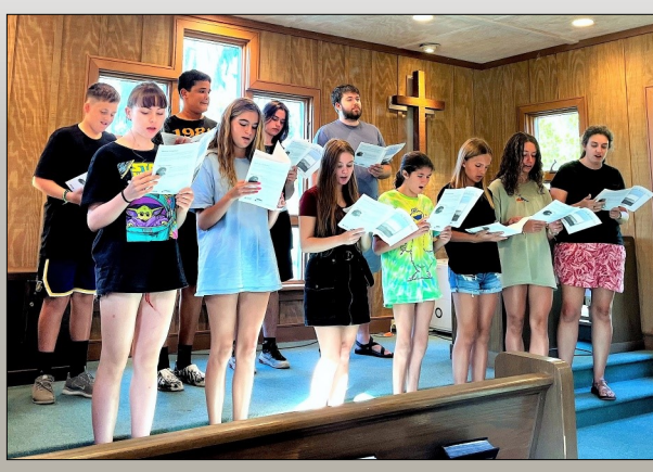
Youth Choir sings at the final Wesley Gardens service of the summer.