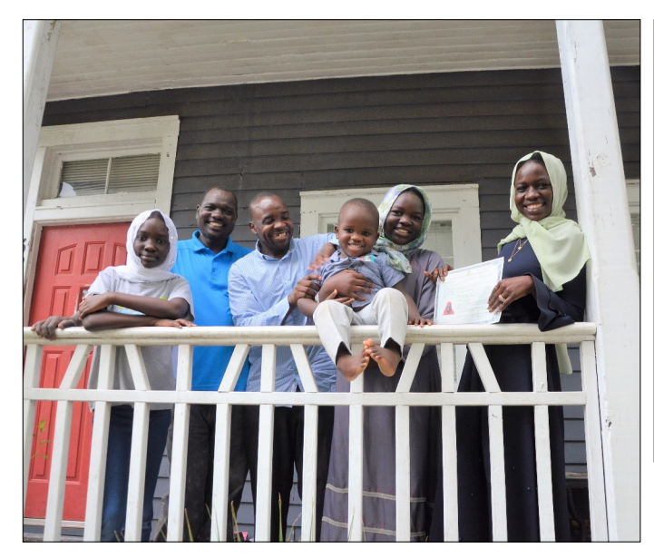
Celebrating a successful U.S. Citizenship test for new Americans during July!

gifts emphasize the love, peace, and grace that are at the center of the Christmas message. More information to come, with the catalog available in November.