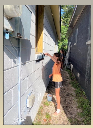
At the end of July, our middle and high schoolers were using their last weeks of the summer to serve God and our community during the youth group's Local Missions Week.