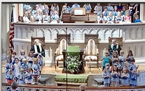
Children led worship on Father's Day.