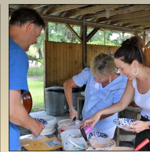
An ice cream social honoring new members and their shepherds was held June 12 at Wesley Gardens Retreat.