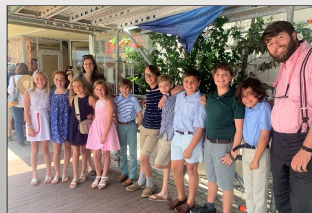
Following church one Sunday in July, our rising 5 th and 6 th graders went out to lunch then enjoyed ice cream from Leopold's.