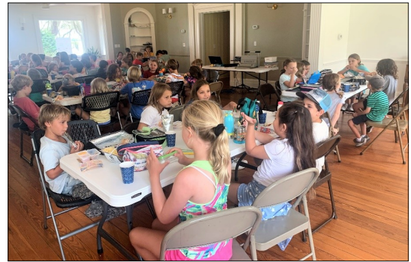
Over 50 children, from Kindergarten through 3rd grade, participated in Summer Fun Daze at Wesley Gardens.