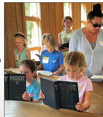
Hymn-singing at VBS