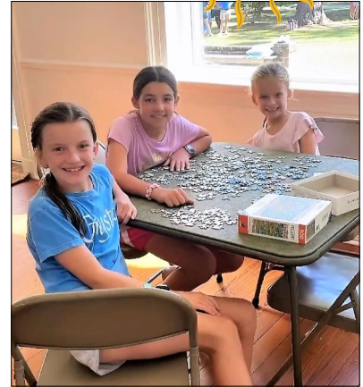
From the water slide outside to puzzles in the Main House, everyone had a fun time at Family Fun Day held at Wesley Gardens Retreat Center.