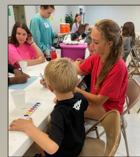
In June, a group of high schoolers from Wesley Monumental traveled to Bayou La Batre, AL to serve with Youthworks.