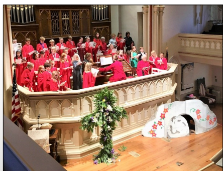
The Children's Annual Easter Play