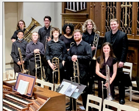
Savannah Trombone Choir led worship on April 24