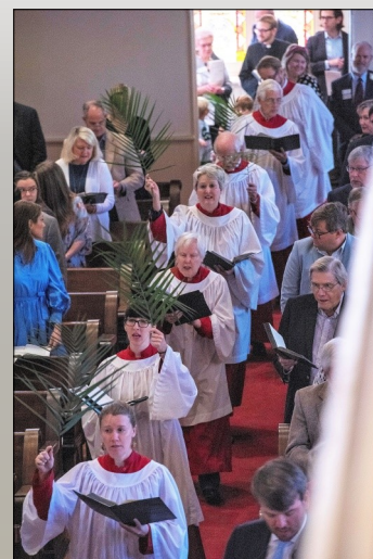
All Glory, Laud, and Honor to Thee, Redeemer King