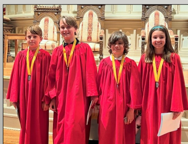
Four Gold Medal Choir Recipients