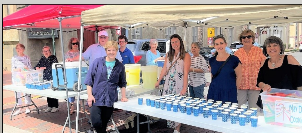
Wesley members handing out cookies and lemonade during Massie's May Day Celebration