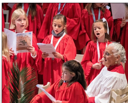
Children singing on Palm Sunday