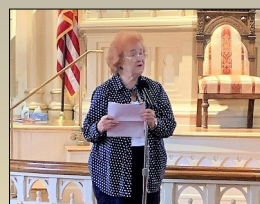
Merry Makers sharing their talents during the May program