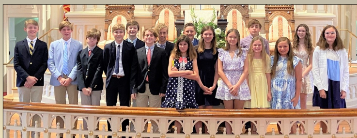
2022 Confirmation Class