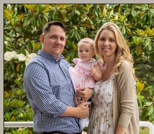
A few of the families recognized on Infant Recognition Sunday