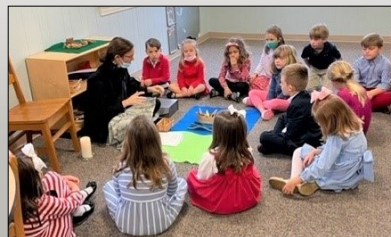
Join us on Sunday mornings for Sunday School and Children's Worship!