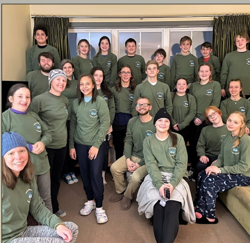
From January 27-30, a group of students and adults enjoyed skiing, snowboarding, snow tubing, and having a great time together on the Youth Ski Trip.