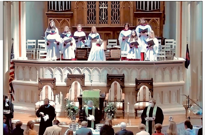
Youth Choir led worship on February 6.