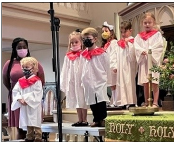
Joyful Noise Choir led worship on February 13.