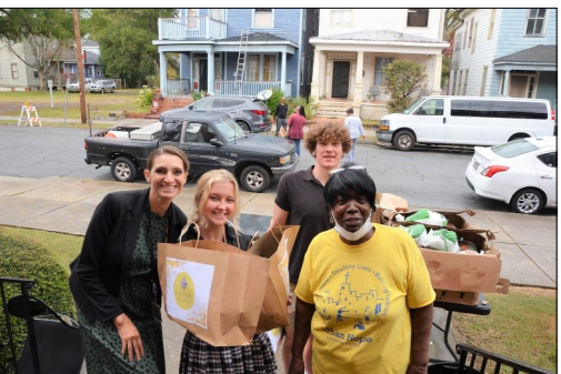
Thanksgiving turkeys and sacks of side dishes for every Urban Hope family, with a handmade card from children.

The Re-Think Christmas Mission Offering serves local and overseas missions, with the offering divided in half every vear (local and international). Many refugee children need jackets, which you have provided.