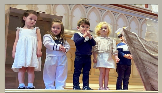
Eli's Place sailors, pilgrims, and Indians singing a variety of songs during their annual Thanksgiving Program. Following their performance, they enjoyed muffins and cookies with their family and friends.