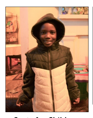
Coats for Children

The Re-Think Christmas Mission Offering serves local and overseas missions, with the offering divided in half every vear (local and international). Many refugee children need jackets, which you have provided.