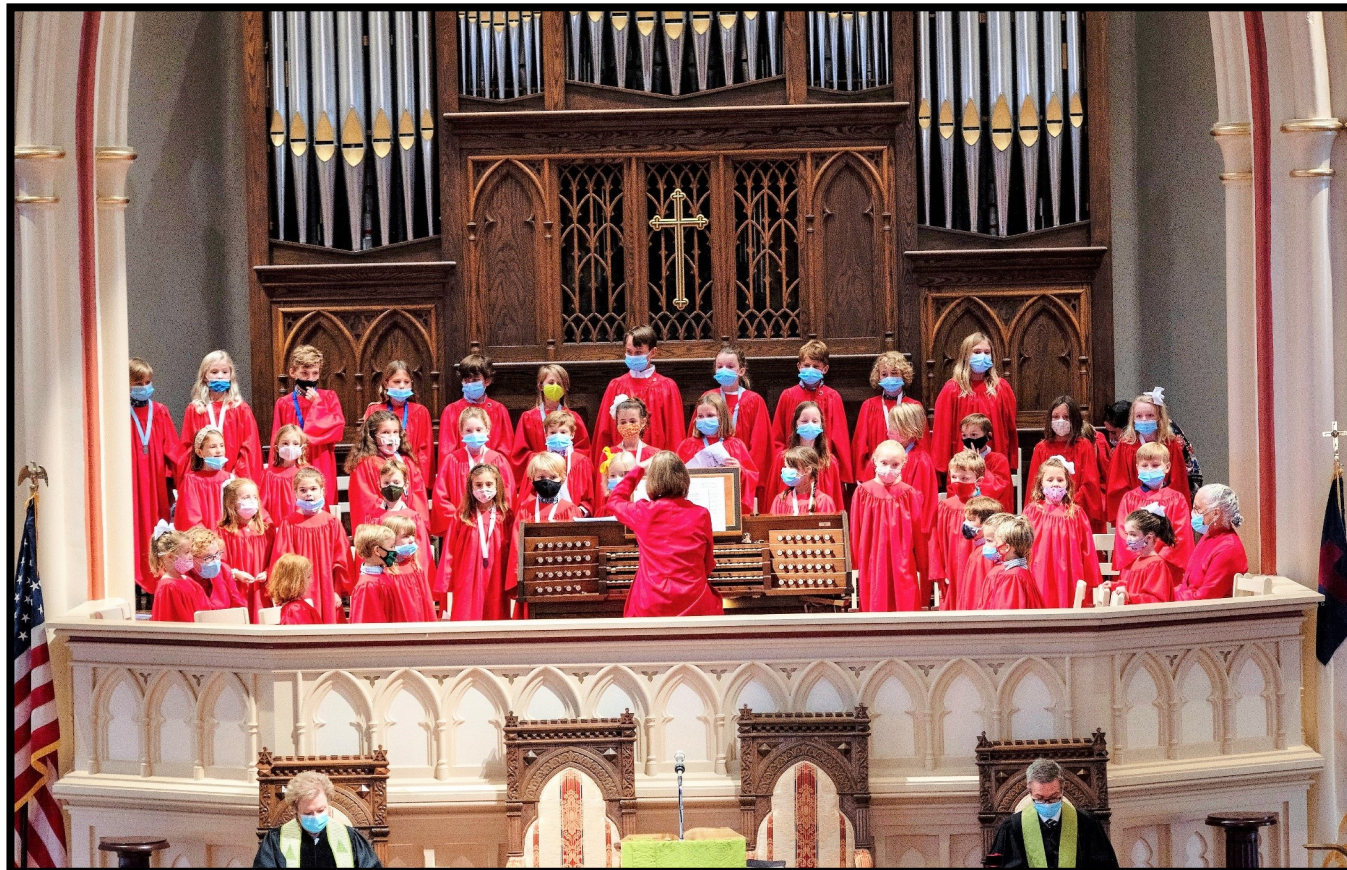
Children led worship on October 24

Choir, Organ, Brass Quintet, and Timpani