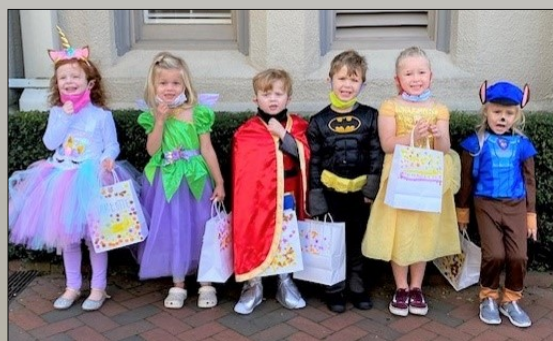
Eli's Place children enjoying their Halloween Parade and listening to a story.