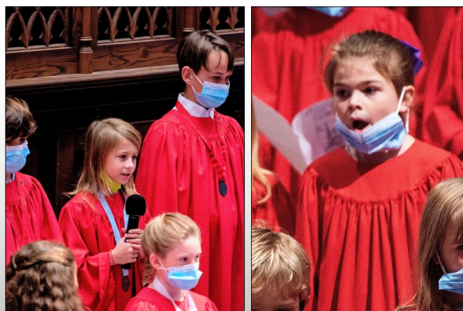
Children leading worship.