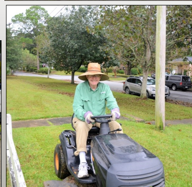
Every other week, Wesley members maintain the lawn at The Living Vine.