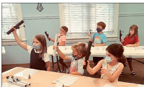
Wednesday evening chime awesomeness!