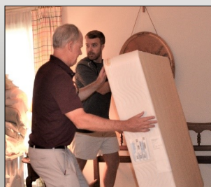
October Y'All Haul