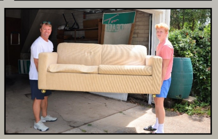
Thank you to our Y'all Haul volunteers who helped move furniture in June for a refugee family.