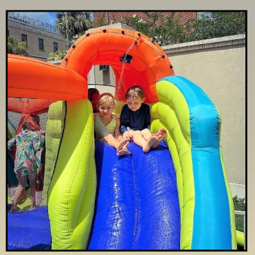
The children enjoyed the "rain" and water during Wacky Water Week at Eli's Place Summer Camp!