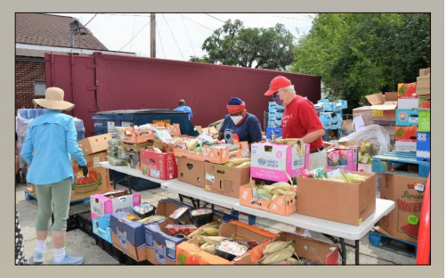
Fellowship of Love Community Church has a drive-in grocery giveaway ministry in the church parking lot on two Friday mornings per month. Wesley members enjoyed serving there on June 4.