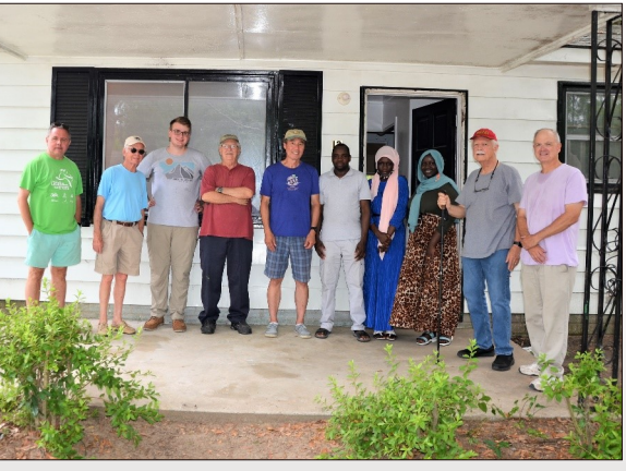
Thank you to the Y'All Haul crew for your work in hauling furniture for a refugee family.