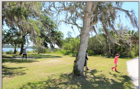
Thank you to all who pulled Spanish moss from camellias and trash from the marsh at Wesley Gardens.