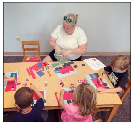
Learning about nurses, fire fighters, and policemen during "Community Helpers" week at Eli's Place Summer Camp.