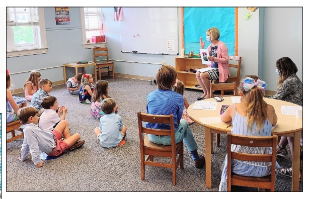
Come join us!