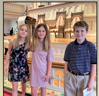
On Sunday, May 2, Wesley Monumental welcomed our newest confessing members, the 2021 Confirmation Class!