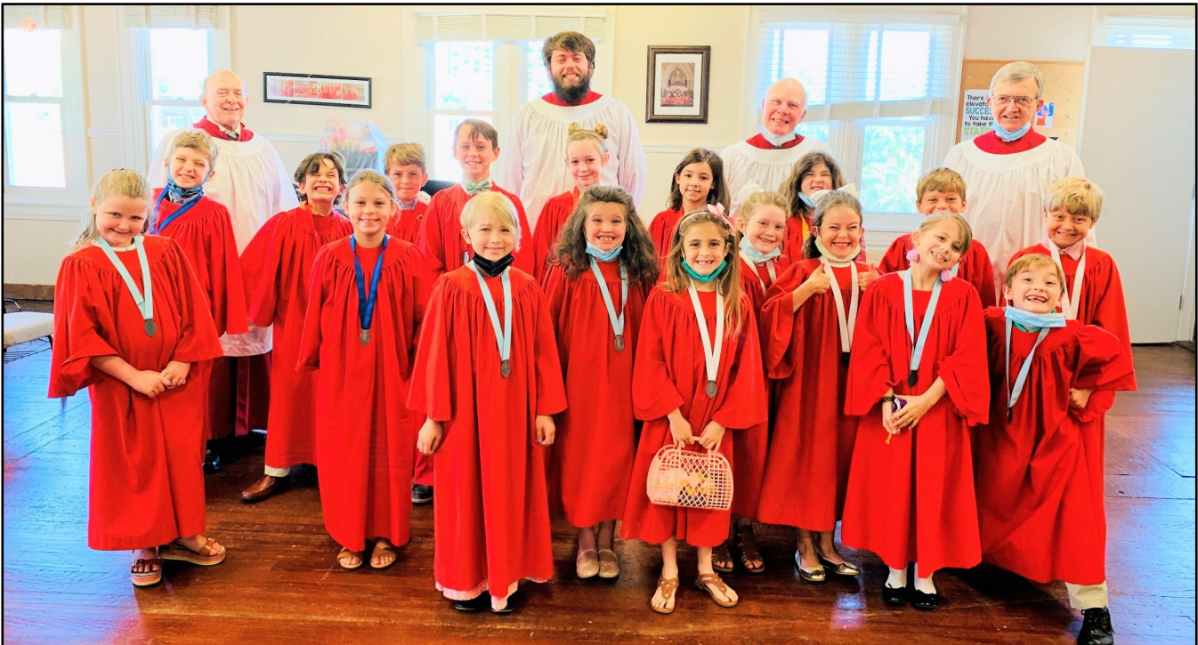
Our gentlemanly volunteers helped the choristers lead worship on Mother's Day.