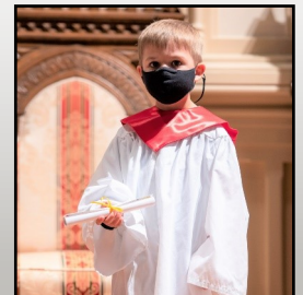
Music Awards Ceremony