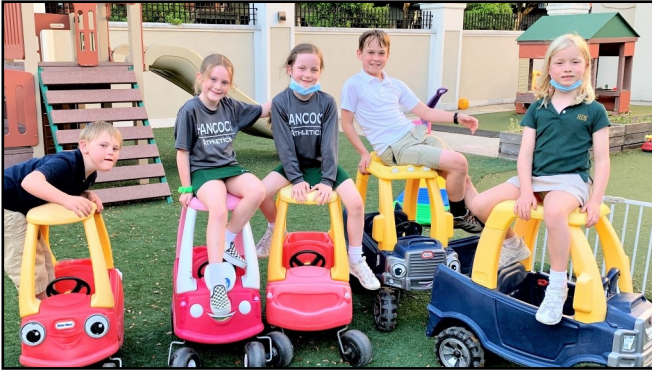
Choristers having downtime on the playground