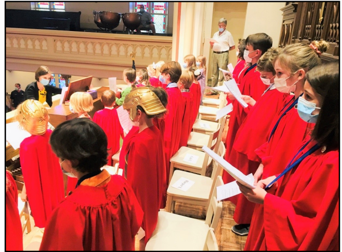
Children's Easter Play