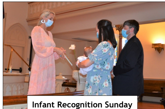
Infant Recognition Sunday

May has been a busy month with Music Awards, Infant Recognition, and Eli's Place Graduation. It is so good to see many of you coming back to church! We are continuing to follow the Georgia Department of Public Health Covid Guidance and will continue to welcome children at the Wayne Street entrance for drop off and pick up.