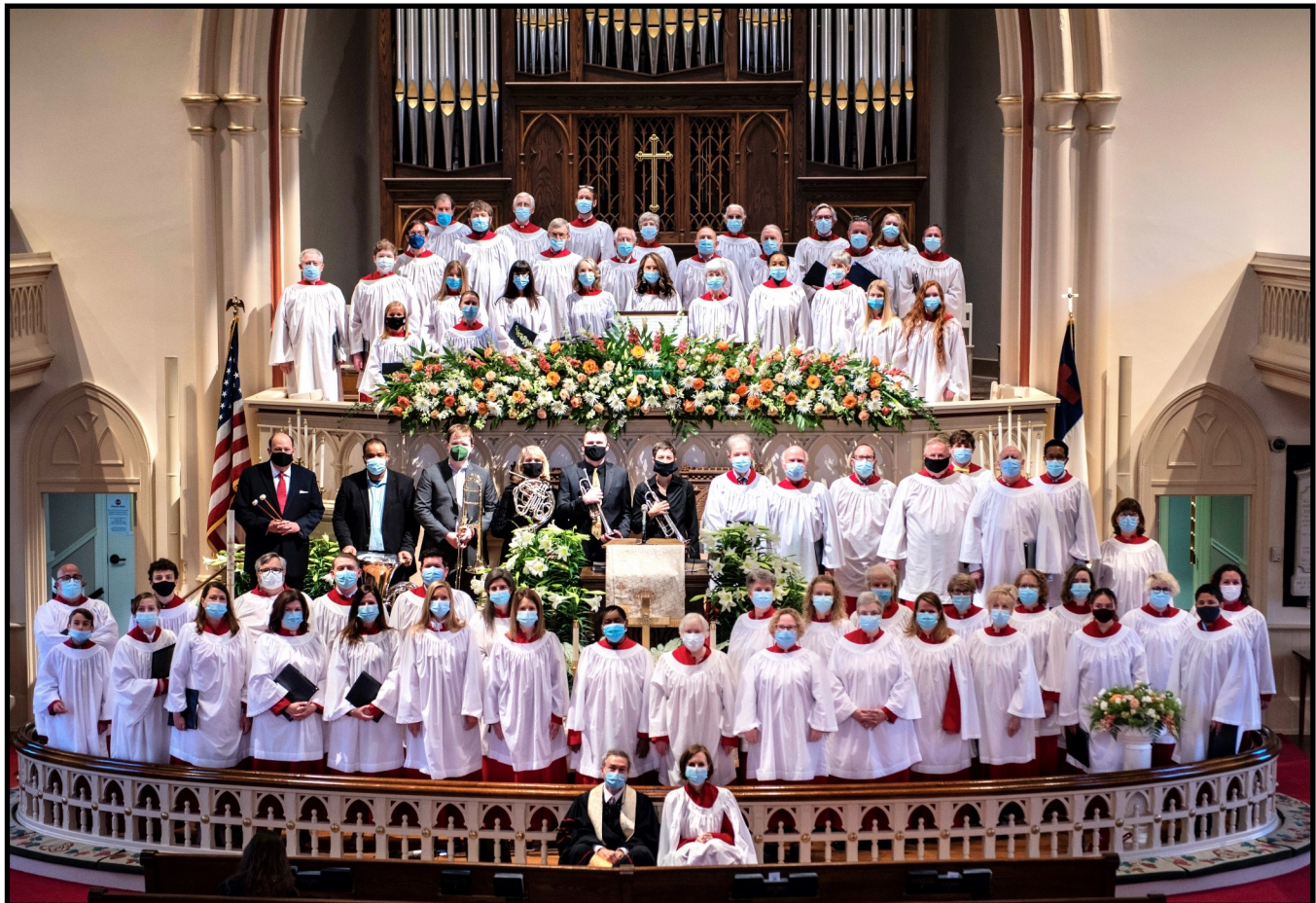
Easter Sunday Musicians 2021