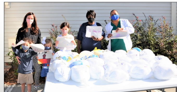
For Thanksgiving, every Urban Hope child, teacher, and the bus driver took home a turkey.