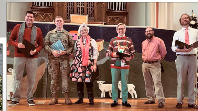
The group known as “Descant Get Enough” (from the Wesley choir) performed at the Merry Makers Christmas event.