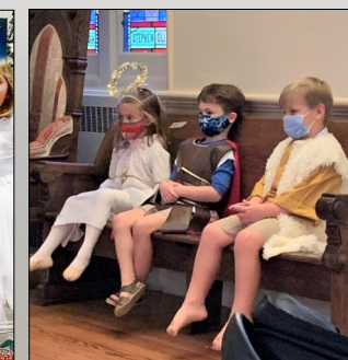
Joyful Noise Christmas Celebration