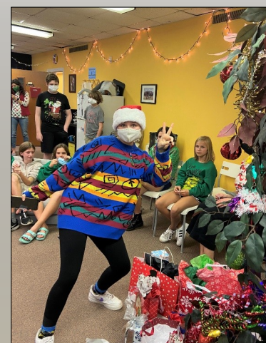
Annual Youth Christmas Party