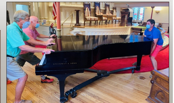
Choral scholars get a workout moving the Steinway Model D back and forth every week for socially-distanced choir rehearsal in the Sanctuary.