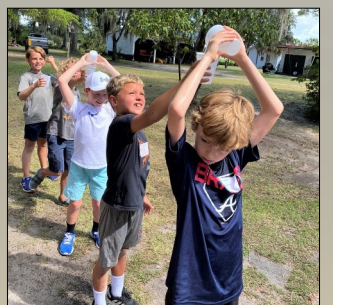
Enjoying Summer Fun Daze at Wesley Gardens!