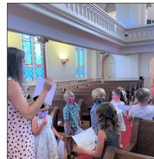
Going on a scavenger hunt in the sanctuary.