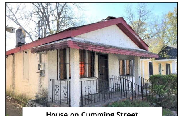
House on Cumming Street