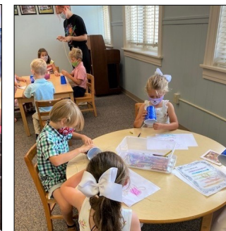
During Children's Worship, everyone had fun learning about Jonah. The children made their very own Jonah and the Whale cup and ball game. Then in another activity, while blindfolded, they tried placing Jonah in the whale.