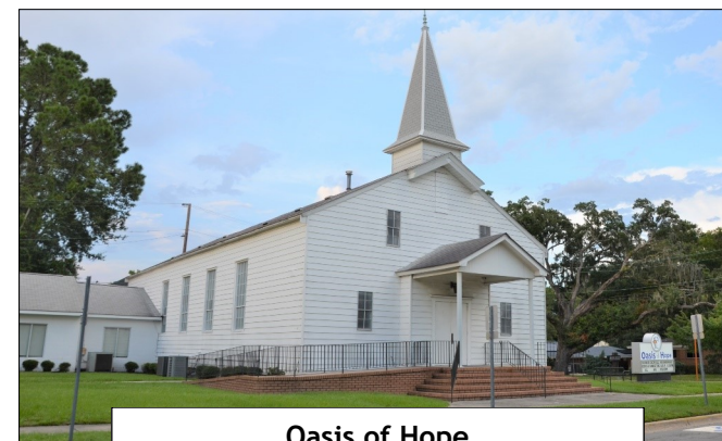
Oasis of Hope