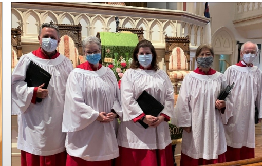
Beautiful sounds from instruments and choir members.