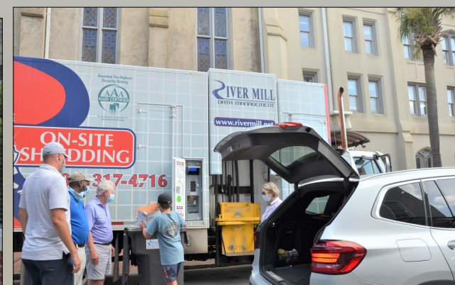
"Shred Your Stress" at Wesley

Wesley members help cut the grass and prune the bushes each week at The Living Vine Christian Maternity Home.