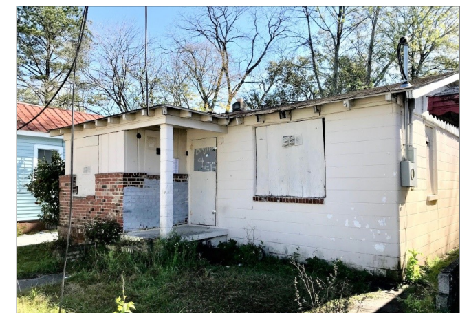
Houses on Cumming Street being provided to Family Promise through the Savannah Land Bank