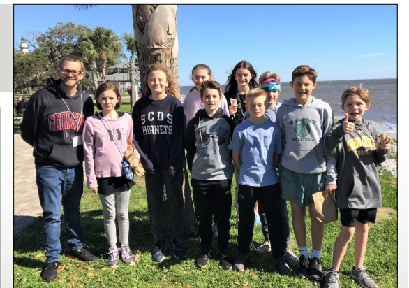
2020 Wesley Confirmants attend a Confirmation Retreat at Epworth By the Sea.