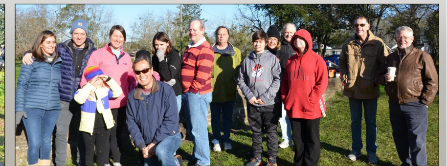
Each month, several Wesley members serve breakfast at a local homeless camp.