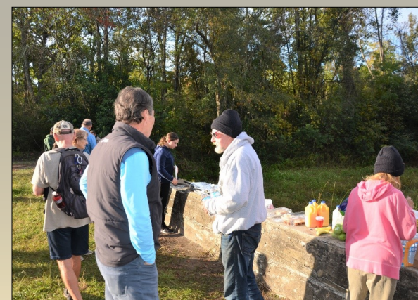
Each month, several Wesley members serve breakfast to the homeless.