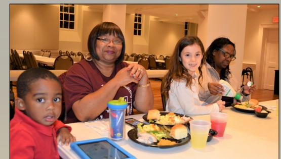
Bible Buddies help serve a Thanksgiving meal (prepared by the Young Mothers' Bible Study) to the children of Urban Hope.