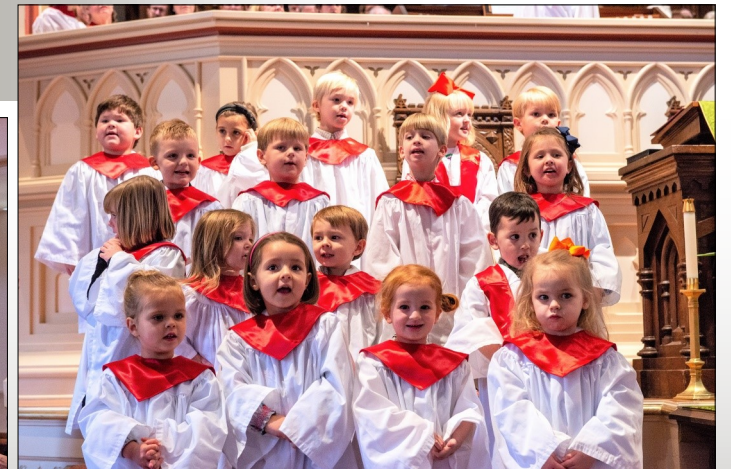
Joyful Noise Choir sings in worship.