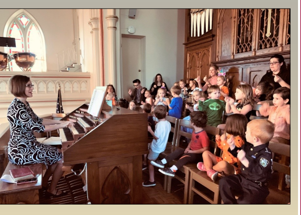
Eli's Place children singing pumpkin carols and listening for the magic Halloween bells that ring when the children shake their hands.