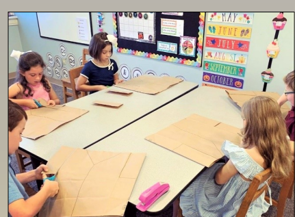
Making logs and rainbow coats during Sunday school.