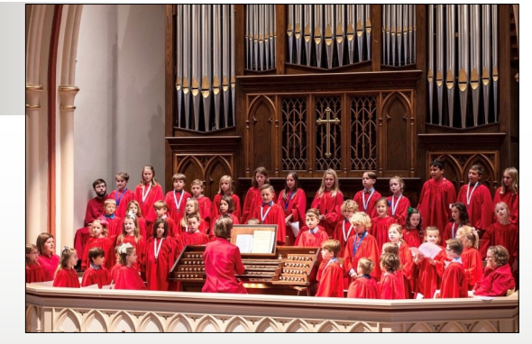
Children leading worship