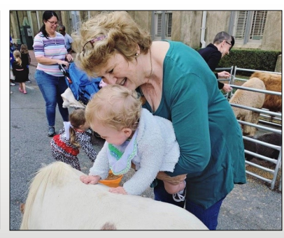
In October, the petting zoo came to Eli's Place. The children had a blast petting and feeding the different farm animals.