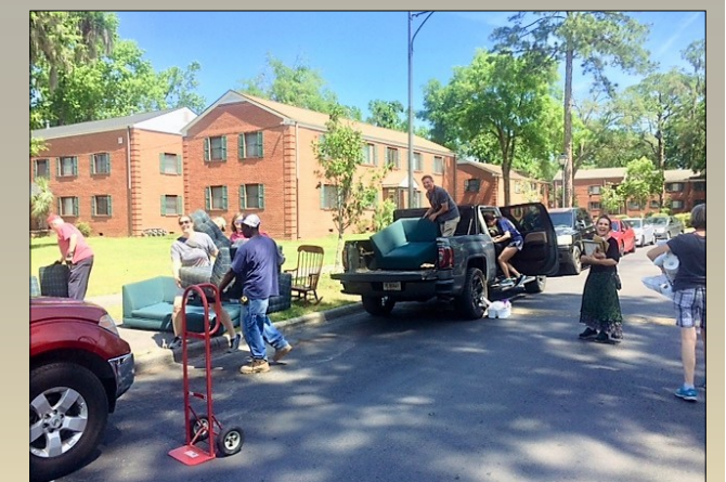
Wesley's Y'All Haul volunteers help deliver furniture to newly arrived refugee families from the country of Eritrea in eastern Africa.