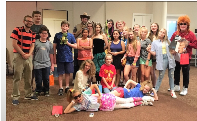
Youth and adult leaders participating in this year's 80's themed Mystery Dinner Theater.