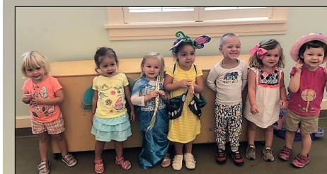
Children dress up as their favorite book character during Eric Carle's Art & Stories week at Eli's Place Summer Camp.