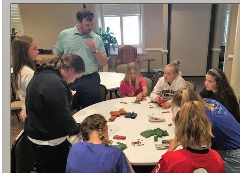
Members of the Youth Group help clean, sort, and roll coins donated to Habitat for Humanity from fountains in the Oglethorpe Mall.