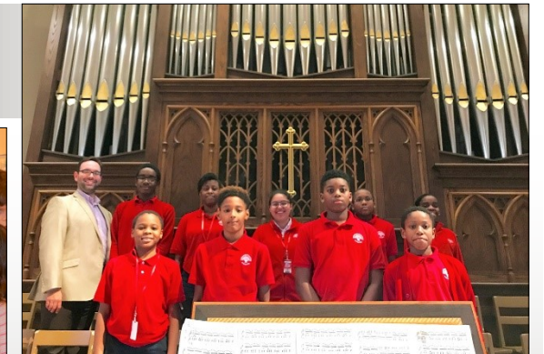
Savannah Classical Academy students receive an organ demonstration and tour.