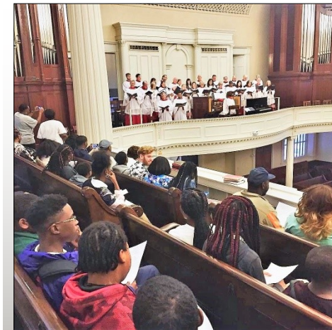
The Chancel Choir sang for Urban Hope Children and their families, and a meal was served by Wesley's Bible Buddies children.