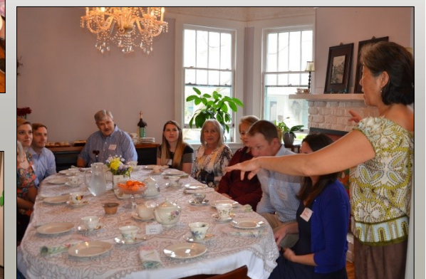
Spring Tea honoring Shepherds & New Members.