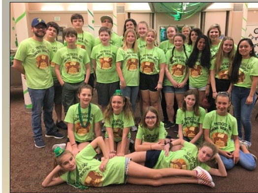
The youth served almost 550 people and raised around $3000. So, thanks to you - if you donated, helped out, prayed for us, or just showed up and ate!