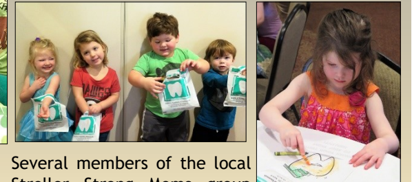
Several members of the local Stroller Strong Moms group stopped by Eli's Place to share healthy habits.