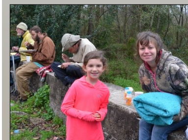
Passing out blankets during the monthly homeless breakfast.