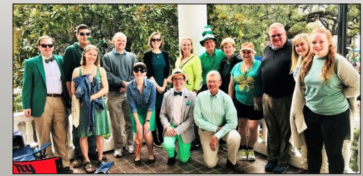
Choir members enjoy the St. Patrick's Day parade from the Oliver Hall veranda.