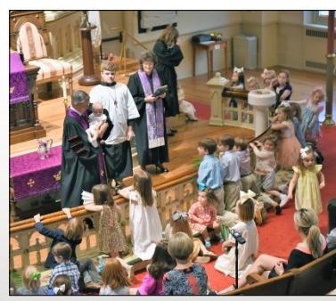
Sunday morning baptism.