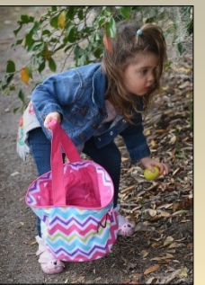
Children enjoying egg hunts at Wesley Gardens Retreat Center and Eli's Place.