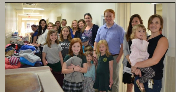
14 adults from the Young Mothers' Bible Study & 17 children from the Bible Buddies distributed food, diapers, clothing, & baby equipment for 22 refugee families.