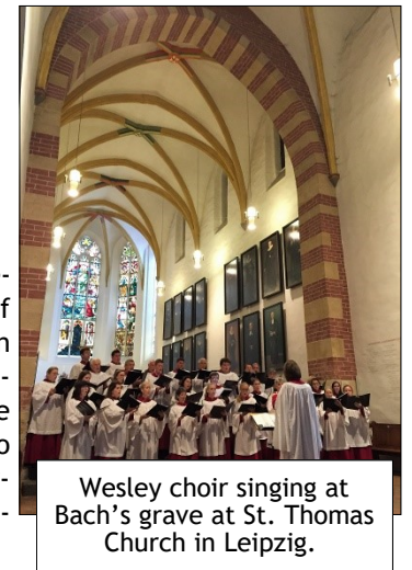
Wesley choir singing at Bach's grave at St. Thomas Church in Leipzig.

Tickets: $35.00 at MonumentalMusic.eventbrite.com (also available at the church office or from any choir member)