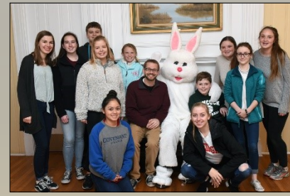
Youth Group at the Egg Hunt.