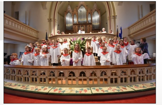
Joyful Noise Choir singing in worship.