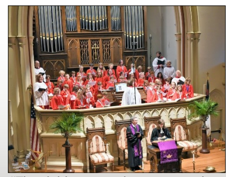
"The children sang their praises, the simplest and the best."