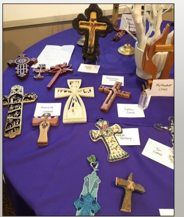
Crosses on display.